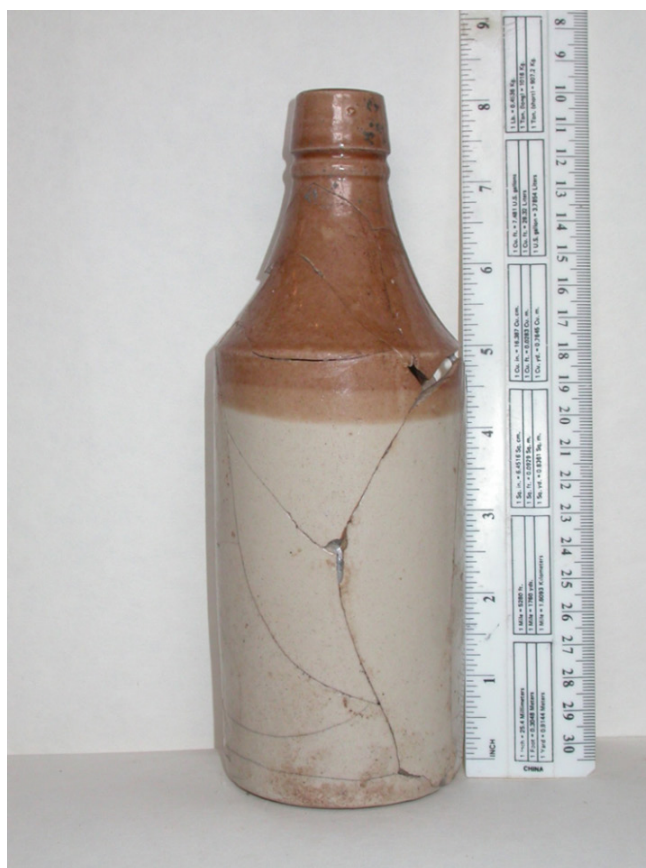
Figure 6. An example of a stoneware bottle.