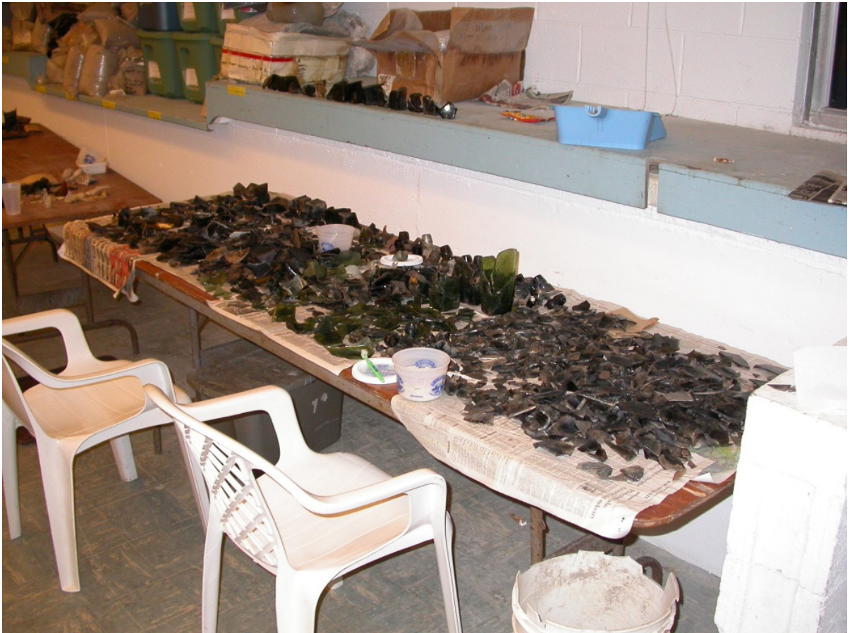
Figure 3. Lab table with fragmented glass.

Fragments of medicine, wine, and other types of bottles were found in the trash (Figure 7). Clay pipe stem fragments were recovered, revealing that someone was a pipe smoker.