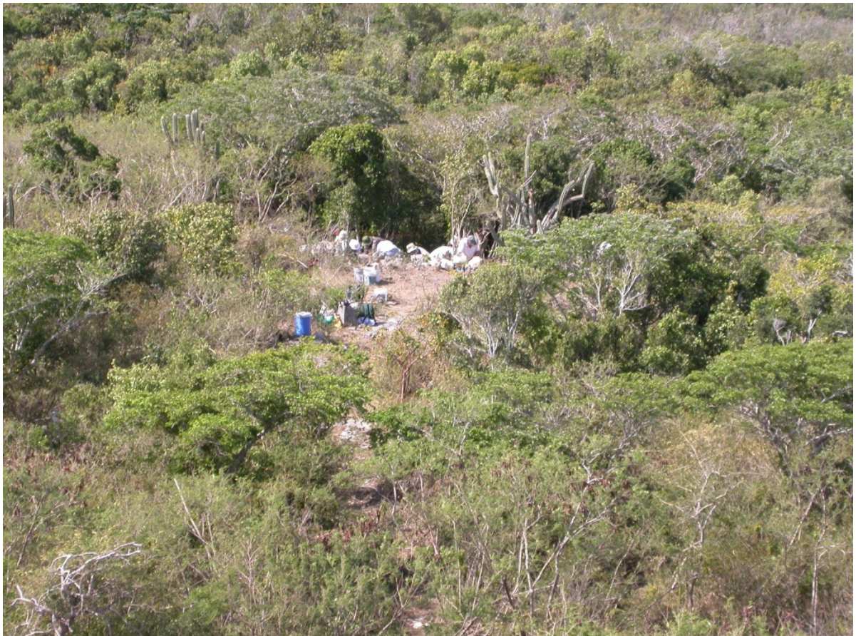
Figure 2. View of excavation from the top of the Lighthouse.

As the trash mound was not deposited in stratified layers, we laid out thirteen parallel rows, each with four squares. The squares