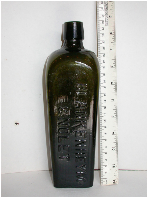
Figure 4. An example of a complete case bottle.

The remains of the West Indian top shell were recovered in the trash. This could have been a food resource or the intrusion of hermit crabs seeking out food. The most interesting finds were fourteen fragments of Lucayan Indian pottery.