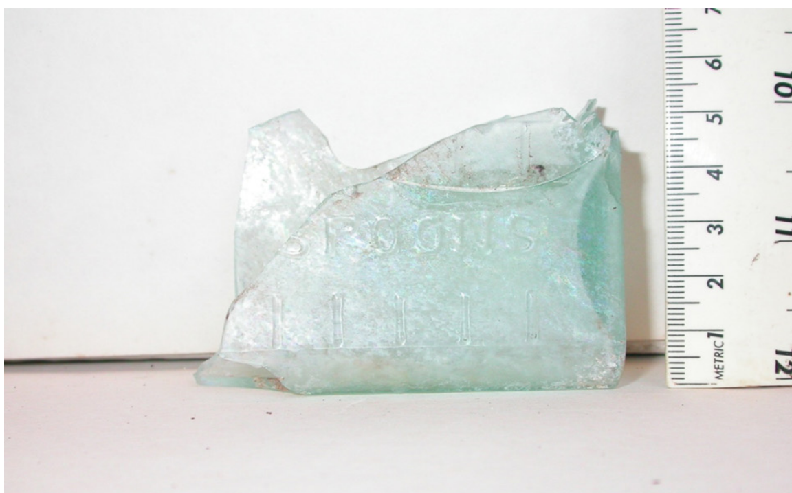
Figure 7. Medicine bottle with spoon dose markings.