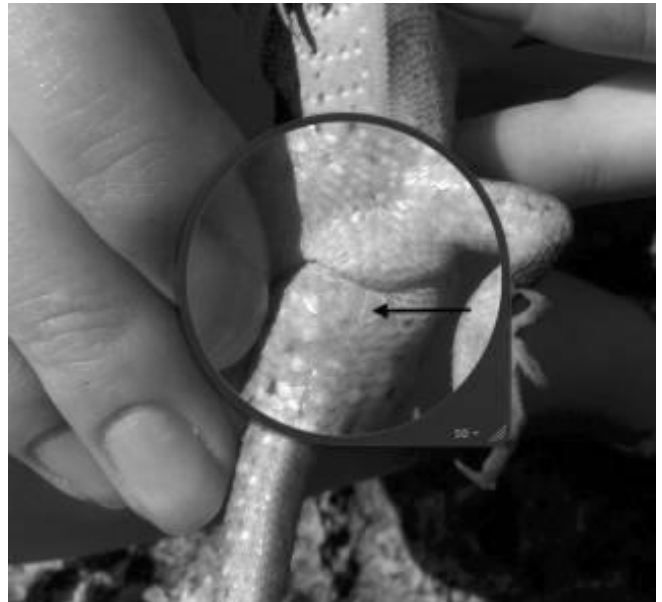
Figure 4. The post-anal scales of a male L. loxogrammus are triangular scales in a hemi-spherical arc just below the vent.

The average adult male SVL was 80.6 mm, while the average adult female SVL was 64.5 using the restricted data sets and using a t-test were significantly different at p < 0.0001 . Males were also much more variable than females. The SSDI for this restricted data set is 1.25. This SSDI value is placed in the context of other members of the genus Leiocephalus in Table 1.