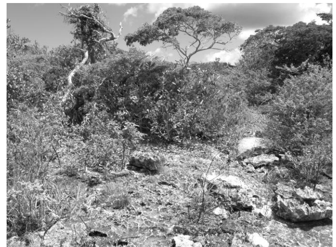
Figure 2. A view of the vegetated patches and open rocky terrain typical of the study site.

This site was selected because of the high abundance of L. loxogrammus . We caught 20 male and 18 female lizards, which were most of the lizards at this site. Lizards were captured with short nooses of braided fishing line on 12