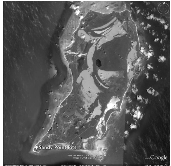
Figure 1. A map of the island of San Salvador, The Bahamas showing the location of the Sandy Point Pits.

break during midday when lizard activity declined. Even by 0900, rocks in the open could exceed 45°C.