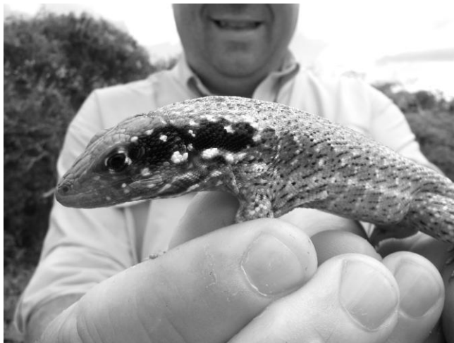
Figure 6. The typical profile of a large adult male showing the characteristic black striping.