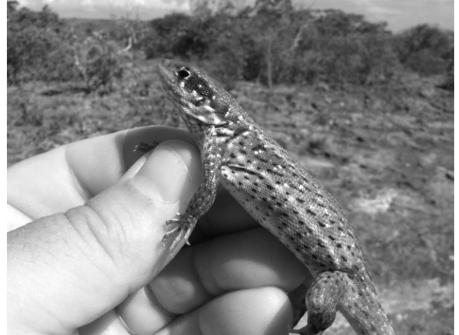
Figure 7. A large adult female that does not exhibit the dark facial striping of the males.

There was strong sexual size dimorphism observed in Leiocephalus loxogrammus parnelli . Males varied in size in a much more significant way than females, no females exceeding 69 mm SVL were captured but nine males exceeded this size.