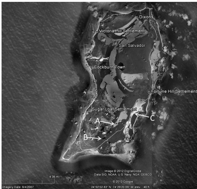
Figure 1. Leaf collection sites on San Salvador (A: Stouts Lake, B: Mermaid Pond, C: Pigeon Creek).

Leaves were collected from red mangroves at the south end of Stouts Lake and Mermaid Pond (Fig. 1 – sites A and B respectively), and the north side of Pigeon Creek (Fig. 1 – site C) in June of 2010. Care was taken to avoid collecting leaves from consanguineous individuals by collecting from spatially separated large trees that were generally more than 3 meters apart. The leaves were placed in plastic bags and transported to the Gerace Lab where they were refrigerated until transport to Florida Gulf Coast University. Leaves were then stored at -80^{\circ}\text{C} until extraction of DNA.