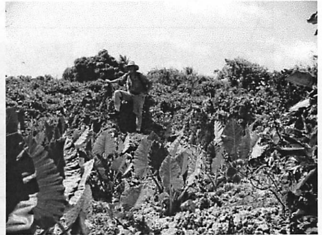
Figure 6. Interior karrenfeld.