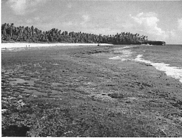
Figure 3. Beach flat at negative tide. No significant discharge is observed.

high permeability pathways in the bedrock. Residents report that the well is ancient, and so was the sole source of freshwater before rooftop rain catchment technology became available.