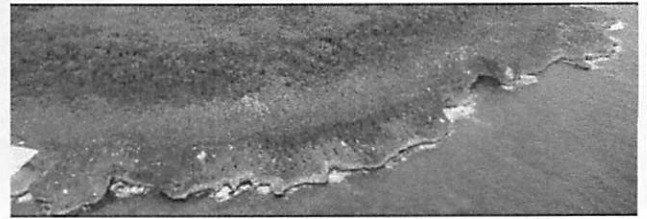
Figure 5. Fossil spur and groove.

tures, especially large coral heads in the rock itself. The island was mined for phosphate by the Japanese from 1914 to 1945, and the degree to which these pinnacles represent subaerial features or exhumed subsoil features is not known.