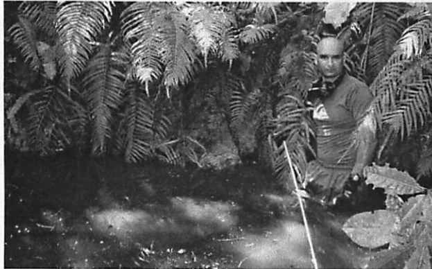
Figure 4. The Old Well.

high permeability pathways in the bedrock. Residents report that the well is ancient, and so was the sole source of freshwater before rooftop rain catchment technology became available.